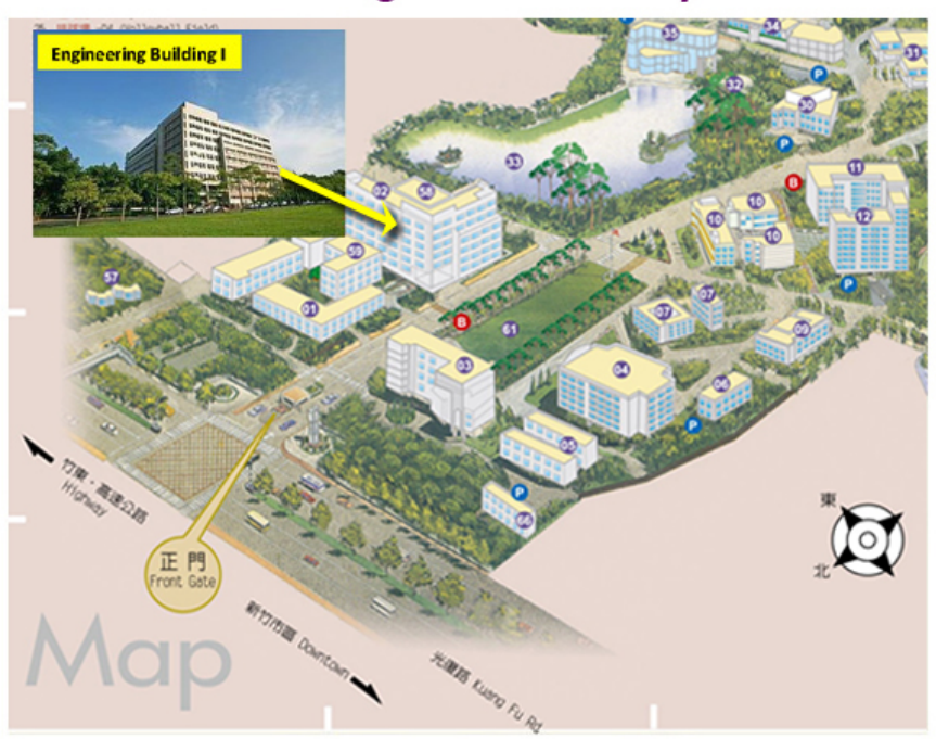
Engineering Building I, 1st Floor National Tsing Hua University